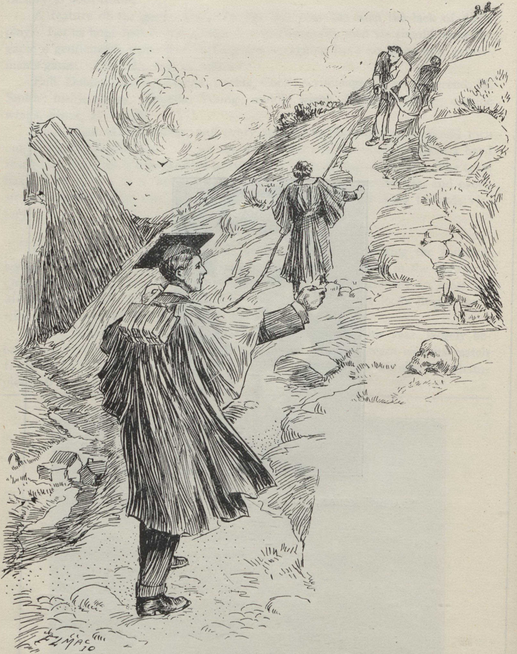
"THE PROCESS EPITOMIZED."