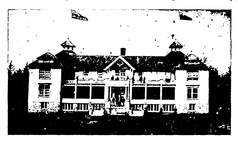
MAIN BUILDING, MUSKOKA FREE HOSPITAL FOR CONSUMPTIVES.

a long journey to a strange place, but to find one's self in an institution where the staff has nothing in readiness for one, and where it is doubtful if there is a bed awaiting one, is really terrible. That is just what I felt through a stupid error of my own. I faced a perplexed and kindly group composed of the nurse, secretary, and matron. I was finally ushered into a great sunlit ward, where eight beds, four on each side, stood about six feet apart. A strip of carpet, a chair, and a small stand with two drawers, a bed, wider than the usual "single bed," of white enamelled iron, with a nice white quilt and fine bed linen, and a great warm extra blanket of grey for cold nights, formed the equipment for each patient. A locker later on would be put at my disposal in the hall, and my trunk in the basement trunk room would be accessible twice a week. My coat and hat I would hang in the lavatory,