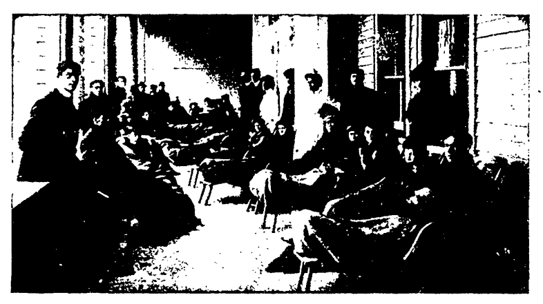
TAKING "THE CURE" AT THE MUSKOKA FREE HOSPITAL

The conversation was fairly animated, and I was struck by the kindly attention given to my requirements by my neighbor, whose hoarseness was terrible to hear. We remained at the table for not less than twenty-five minutes. After dinner a pretty inmate of my ward came to tell me that we were expected to rest from one to three, the same routine as at the Sanatorium. I regret to say I broke the rule, and climbed up among the pines and firs on the top of the rocks near the hospital, as the longing for seclusion, for the chance to "think" out the thousand and one