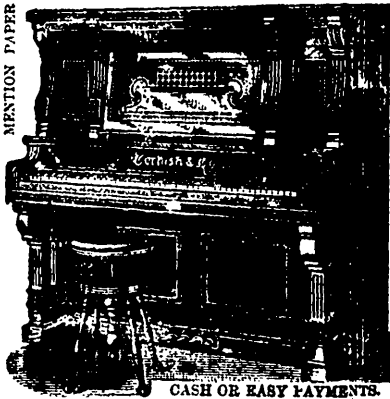
CASH OR EASY PAYMENTS.

PIANOS FROM $125 COMPLETE WITH LATEST MUSICAL ATTACHMENTS