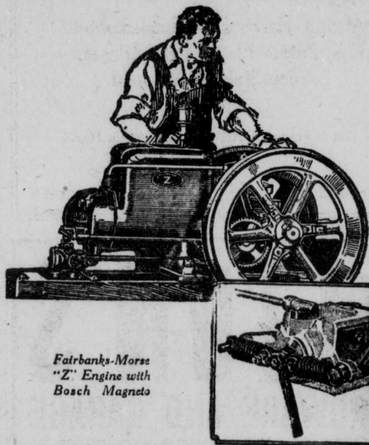
Fairbanks-Morse "Z" Engine with Bosch Magneto