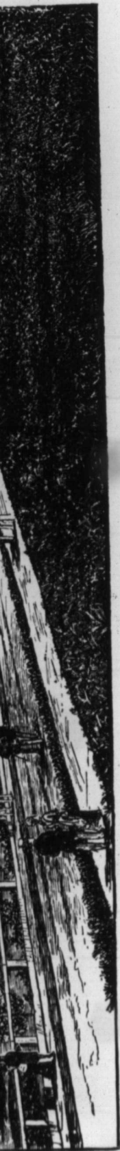
TRINITY COLLEGE SCHOOL, PORT HOPE.