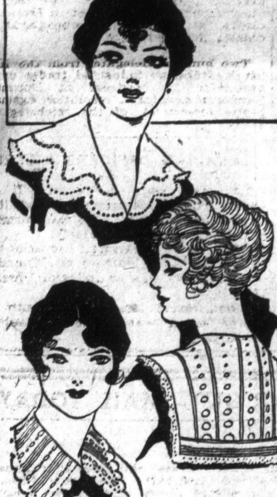
Charming Neckwear for the Idle Hour.