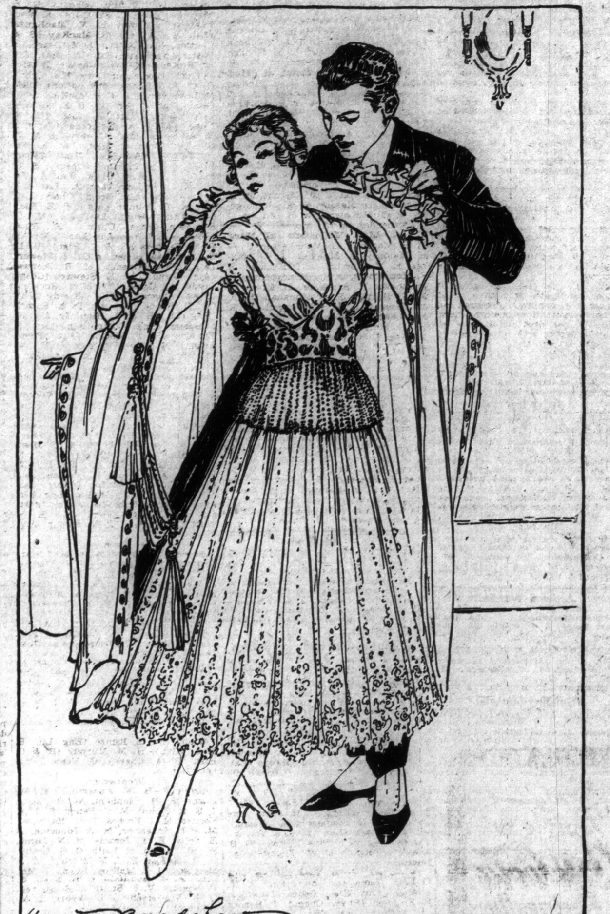
WHEN YOU ARE GLAD THAT YOU HAVE A REALLY HANDSOME WRAP.