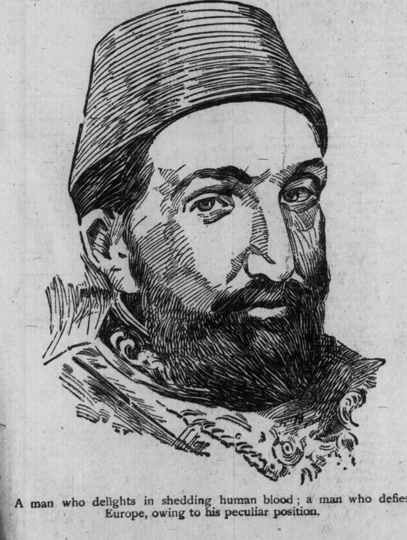
A man who delights in shedding human blood; a man who defies Europe, owing to his peculiar position.