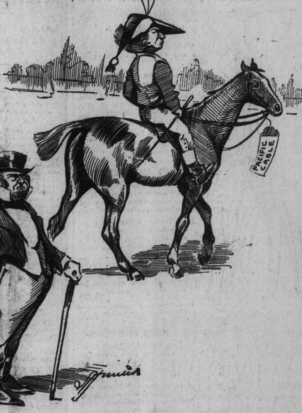
MR. BULL: Blow me if e'down't look better than e did at first. I've a jolly good hidea of puttin' a little more money on 'im.