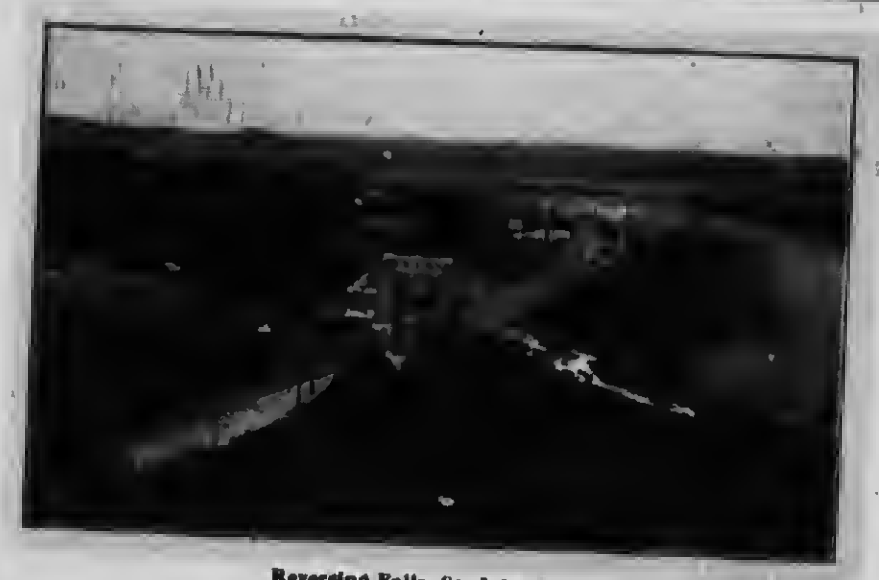
Reversing Pails, St. John River