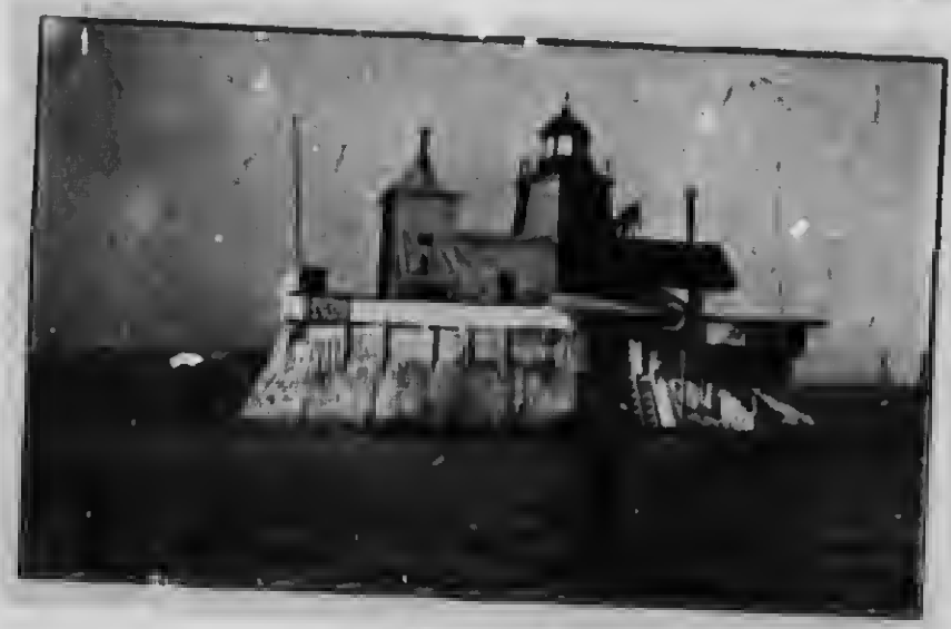
The Beacon Light

and flow is one of Saint John's attractions.