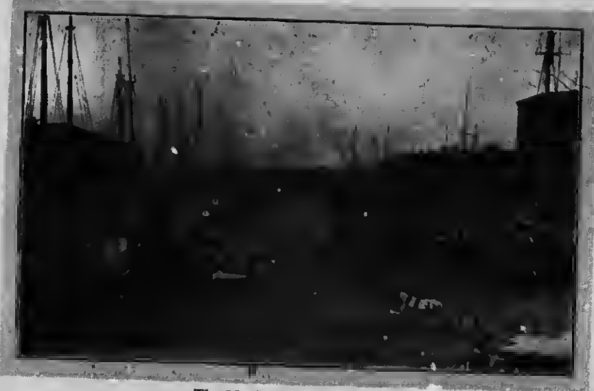
The Market Slip-Low Tide