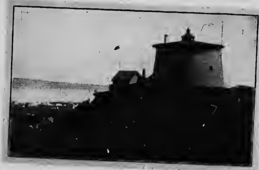
Martello Tower, St. John

whose frowning cannon guard the entrance to the harbour, along a rugped, beautiful and wild stretch of beach where at "Fern Ridges" secrets of the prehistoric age are revealed, until "Smugglers' Cove" is reached, a reason for the romance that clings about the sailing vessel may be found. This spot, according to legend, was a favorite haunt of those that flew the black flag from their masts' heads. Wild tales are told of border life