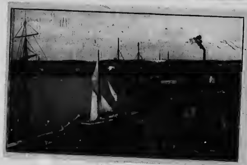
St. John Harbour