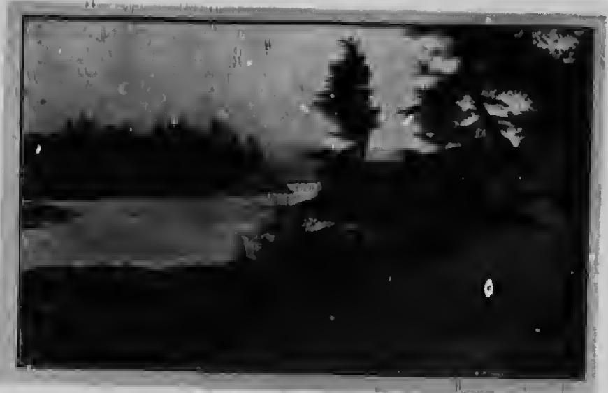
Near Reversing Fails, St. John River