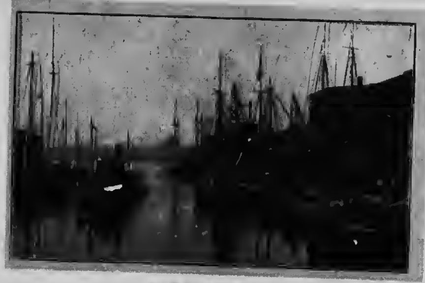
The Market Slip-Iligh Tide