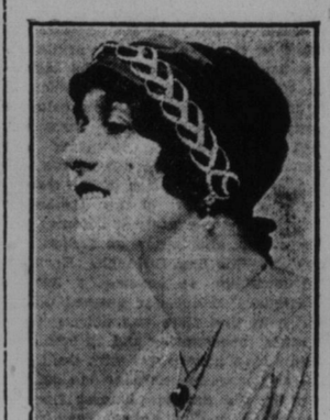
Lina Cavalieri in "The Shadow of Her Past" (Pathé).

Each day next week, beginning Monday, we will publish a picture, omitting the name of a star well-known in the Movie World. Two for the Imperial Theatre, two for the Lyric, two for the Opera House and two for the Unique.