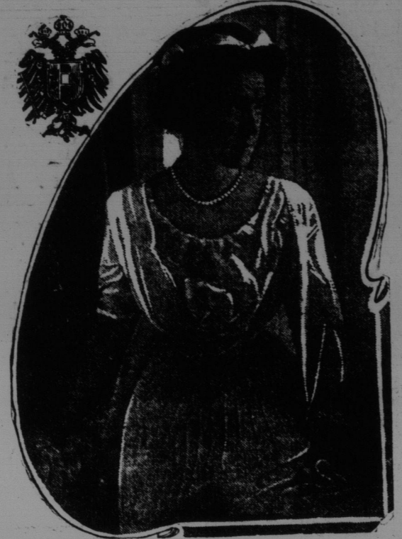
COUNTESS WALDBURG, FORMERLY ARCHDUCHESS ELIZABETH OF AUSTRIA.