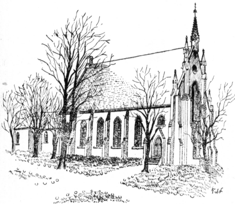
GRAFTON ST. CHURCH.