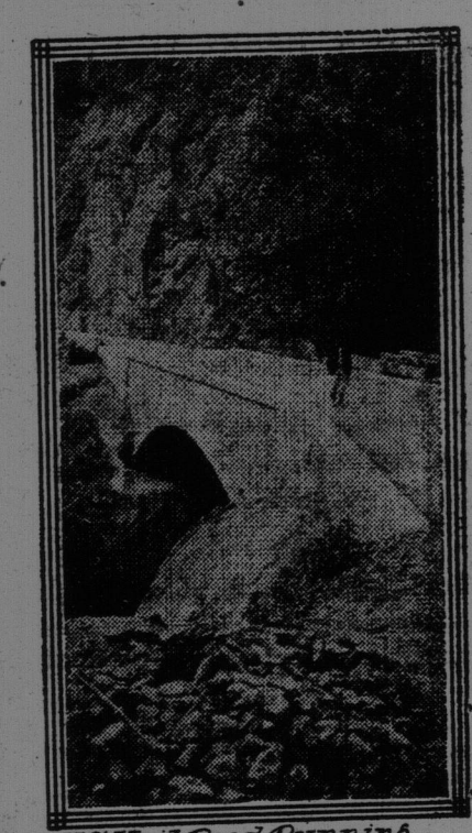
U.S.Mail Road Running Morth from Manik