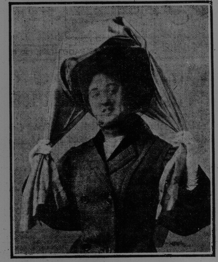
SOMETHING NEW IN AUTOMOBILE VEILS.

Novelties in automobile veils appear in such rapid succession that it is quite difficult to keep track of these new ideas, much less purchase each and every one that makes its appearance. Quite the newest of these is one which is unusually becoming and decidedly practical. It is made in two pieces and in two weights of chiffon. It is a yard and a half long, and the heavier weight is made to cover the hat and tie under the chin, while the lighter weight and that which is used as a face covering, draws snugly under the chin and ties at the back. Both veils are the same length and joined together a quarter of a yard each side of the