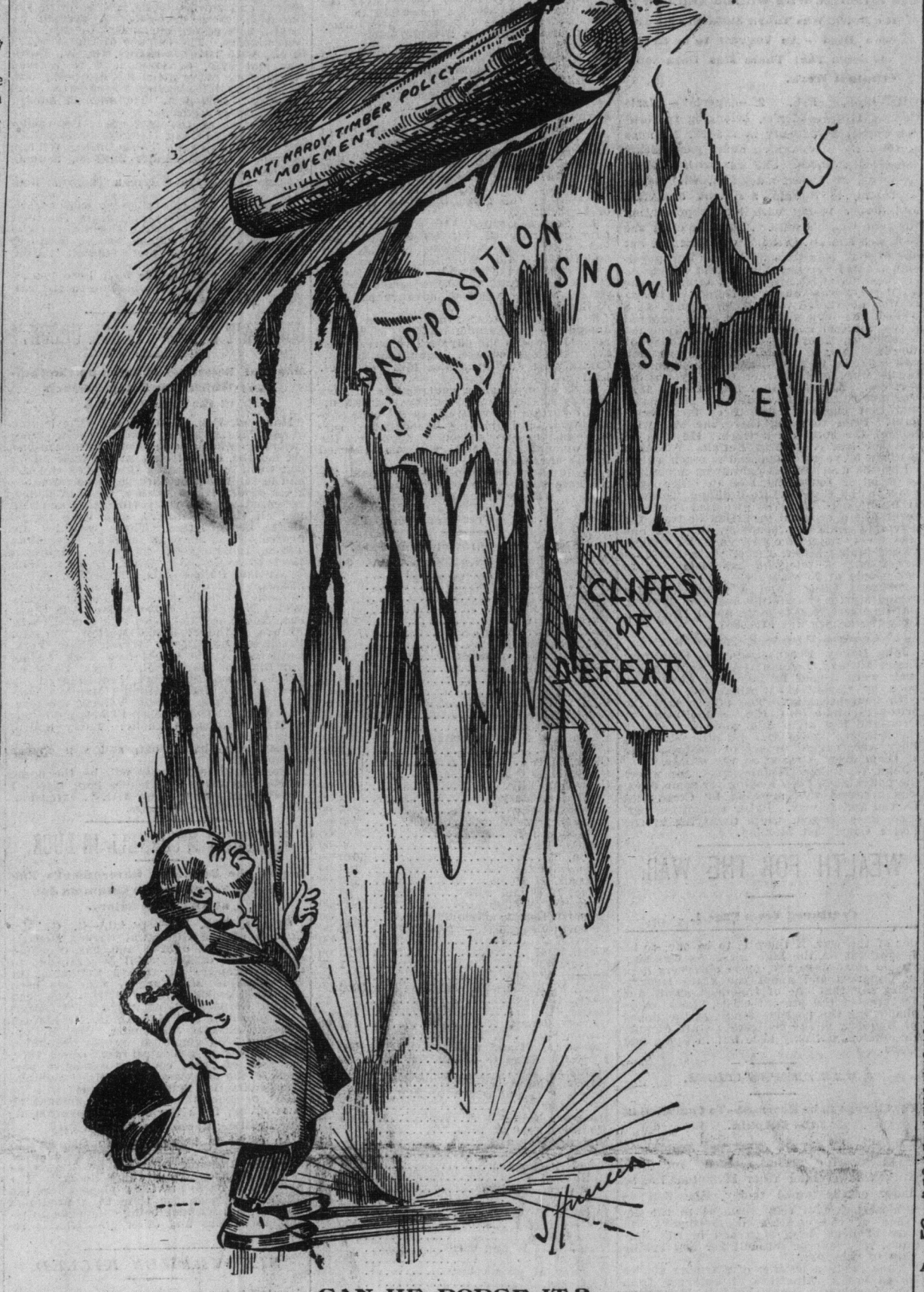
THE WAR IS ON IN EARNEST

Canada in her day has sent many missions to Washington in order to secure better terms from the people of that country. In almost every case we have gone there as supplicants, and to our mind we have gone there much too often in this capacity.