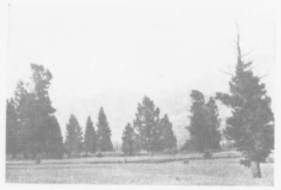
EASY CLEARING PROPOSITION

The Columbia Valley Irrigated Fruit Lands, Limited, have a nursery on their grounds near Wilmer in which seedlings and young trees of many varieties are being tried out and are ready for sale. These include apples in many classes, crabapples, cherries, Japanese walnuts, horsechestnuts, flowering shrubs and ornamental trees.