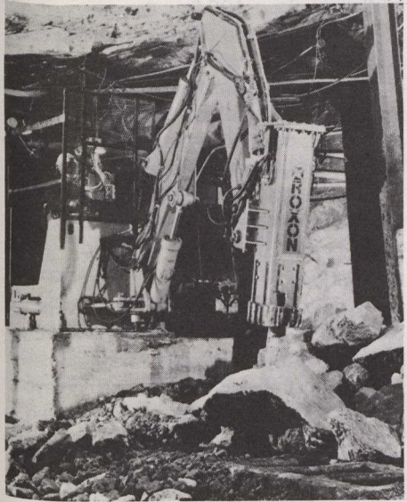
The TM16 hydraulic breaker boom, manufactured by Teledyne Canada, is used in underground operations.

Specialization is a major feature of the approximately 100 companies that form the Canadian mining machinery and equip-