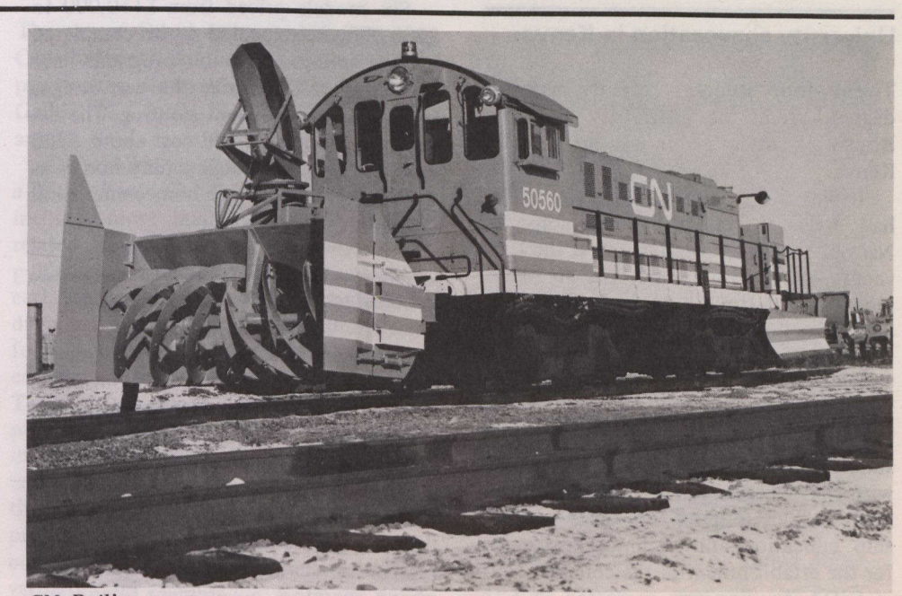
CN Rail's new snow removal vehicle, the Snow Fighter.

For quick unloading of the gondola cars another CN Rail innovation is being used. A front end loader equipped with a powerful blower attachment moves down the cars, passing from one to the other on the drop ends which have been specially