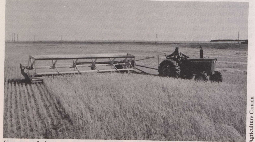
If exports of wheat are to increase, more than 22 million metric tons are required.

"The realities of global interdependence will require increasing attention to the North-South dimension of international economic relations over the coming months," said Mr. Trudeau. He added that in order for OECD countries to participate fully at this critical stage in the development of the world economy it is important for them to encourage analysis by the Secretariat and promote greater discussion among themselves.