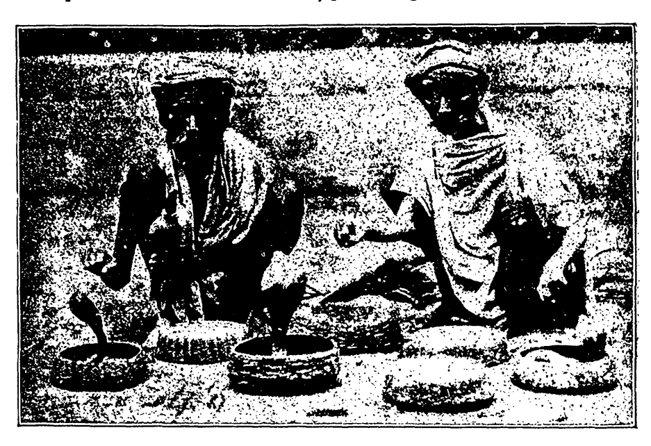
The Snake Charmers.

daboya, and karite, is very deadly, and which, when distended, as they always are these are the snakes generally found around about our houses, out houses, and gardens.