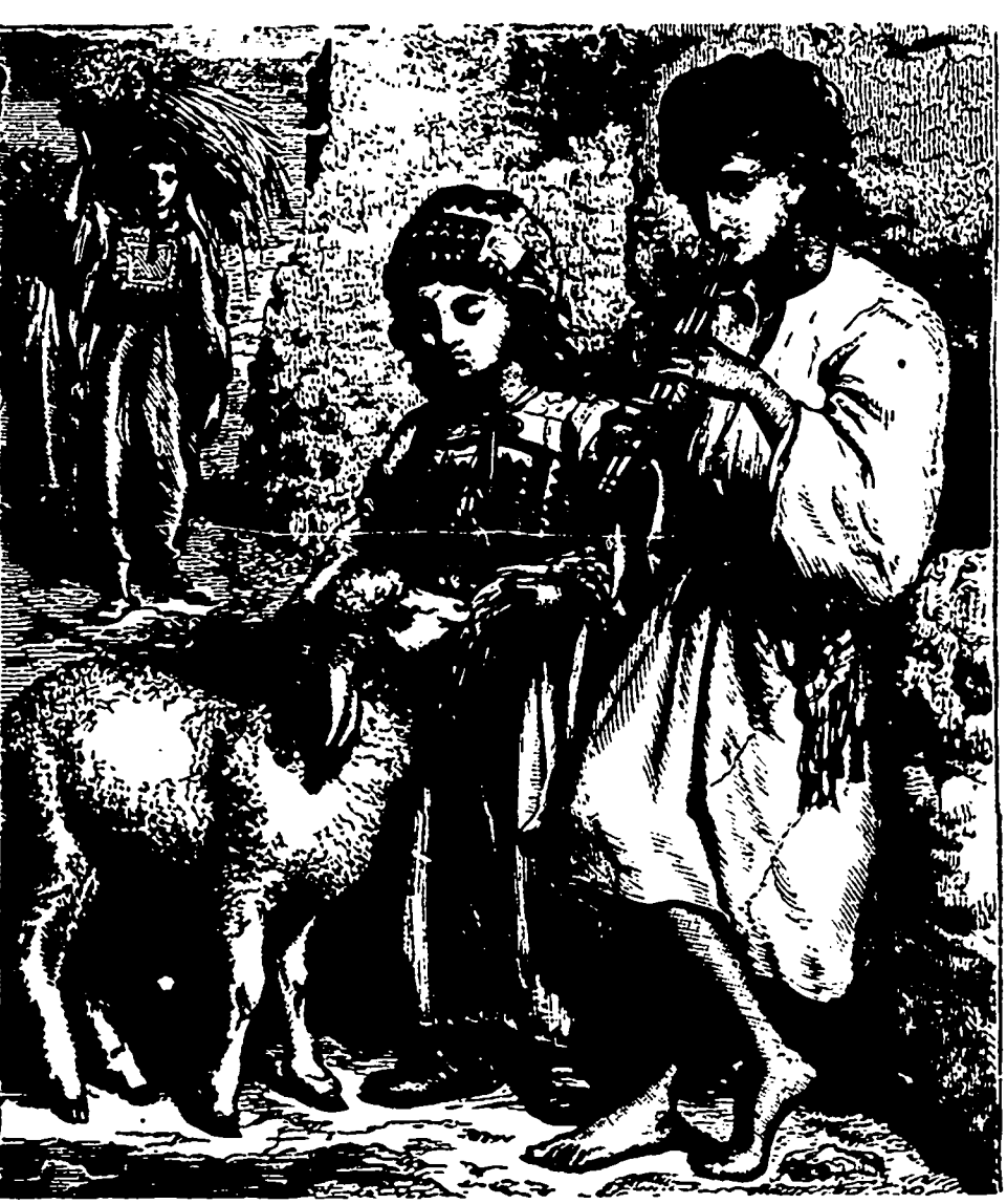
CHILDREN OF BETHLEHEN.