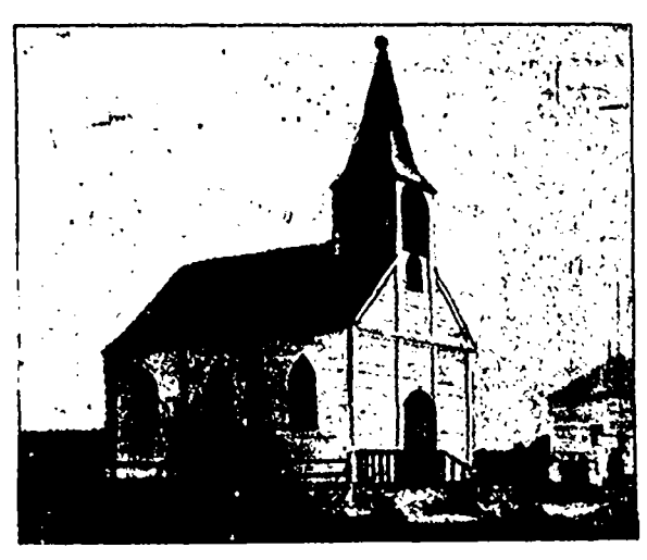
CHRIST CHURCH, CHIPPEWYAN, ATHABASCA.

three weeks' stay at one unfinished hou; at the Landing was relieved of any monotony by our being called on by the Mounted Police, with every available inhabitant, to fight the fire that came rolling in fiery masses down the hillside and threatened the houses and stores.