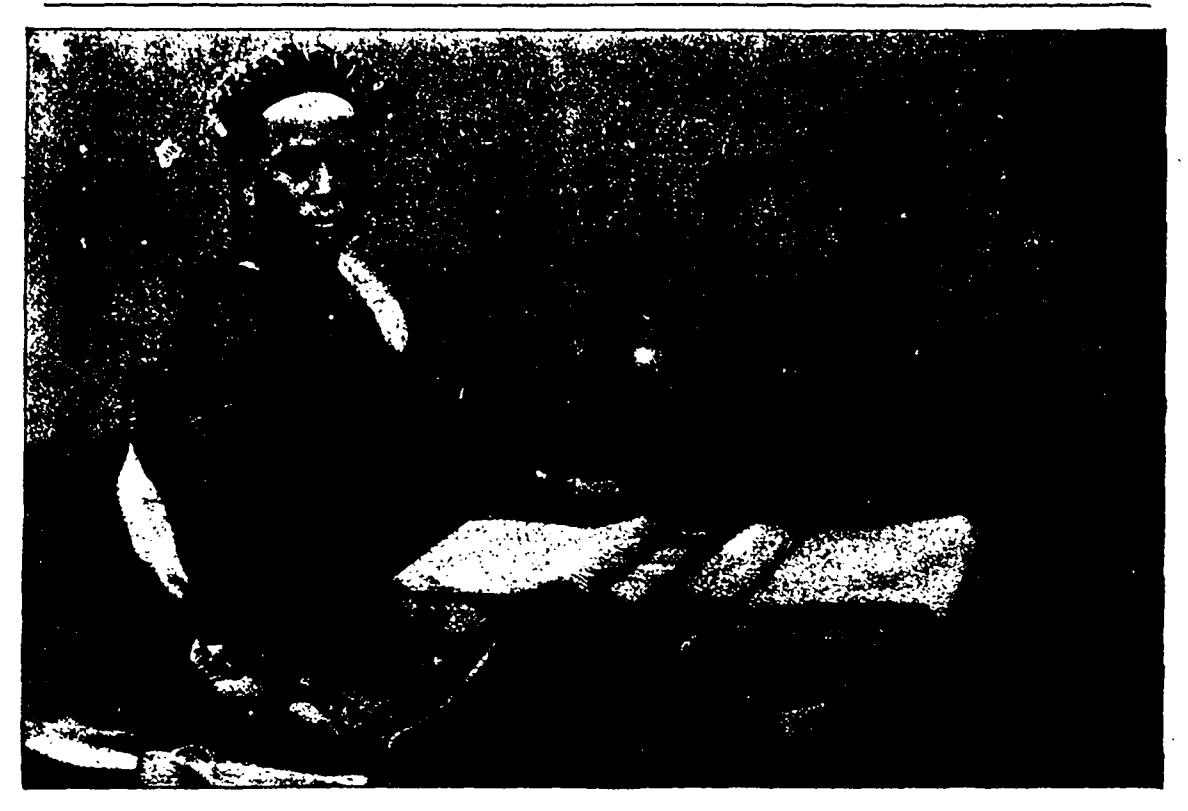
A Pe-po-hoan Weaver—The Matron of the Girls' School.

tables, he does not object to the drudgery of his lot. The Pe-po Hoan farmer, in the Kap-tsu lau plain, would be tolerably comfortable, were it not for the oppression of the Chinese land-owners and yamen men, who often rob him of his hard-earned cash and evict him from his land. Under the Japanese régime all this is likely to be changed, and the various aboriginal tribes may look forward to a brighter day under the flag of the "Rising Sun."