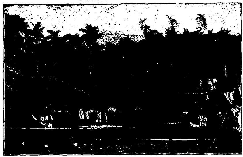
A VILLAGE IN EASTERN FORMOSA.