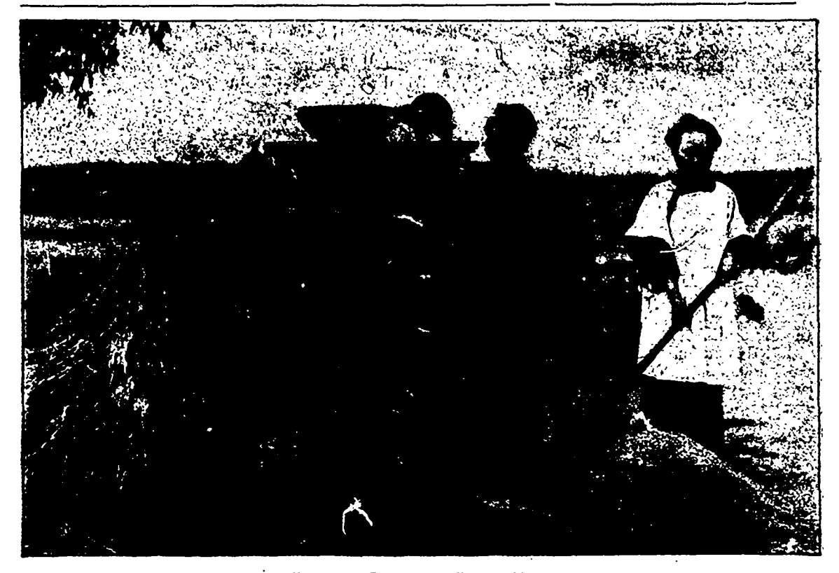
WINNOWING RICE WITH A FANNING MILL. FORMOSA.—See page 81.

or amuse one's self with anticipating the pilot's choice of channels amid "bars" and shallows, than to be creeping under the banks and round the sand bars, and thrusting one's craft up the "schneis" in an incessant struggle up stream. However, this was in store for usin due course.