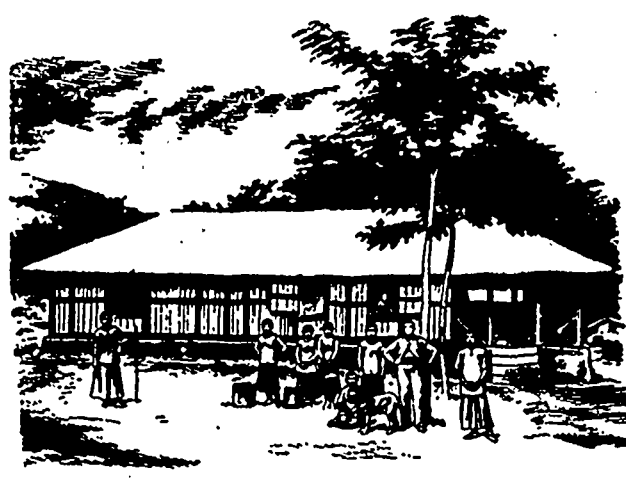
A MISSION HOUSE.