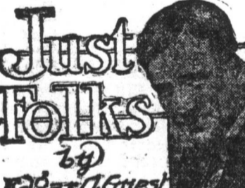
NOT ALL IN VICTORY.

To literally throw yourself into a chair or on a couch, with every muscle limp, and your mind blank, and do lie there for ten minutes would do you as much good as two hours sleep. But such relaxation usually comes when one is thoroughly exhausted, and its benefits are never known as a daily habit. Try each day to sit still and think of nothing for ten minutes. Relax every fibre of your being and give it the luxury of limpsness. So tense and high strung are most of us that after a long day spent in the hubbub of shopping we wearily climb into the