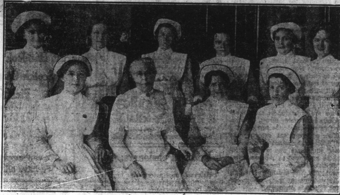
NURSING STAFF OF S. A. WOMEN'S HOSPITAL, TORONTO. Note that in this institution, as in all Salvation Army maternity homes, the nurses wear the regulation uniforms of all hospitals.