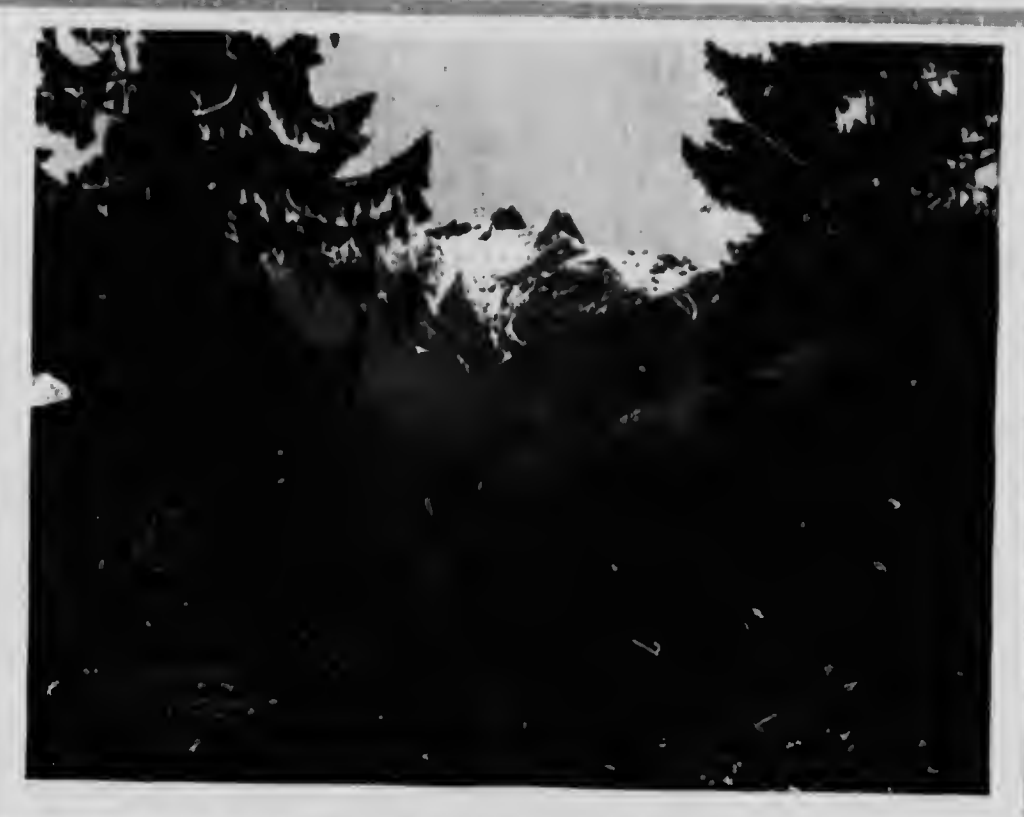
View of the Lions from Grouse Mountain