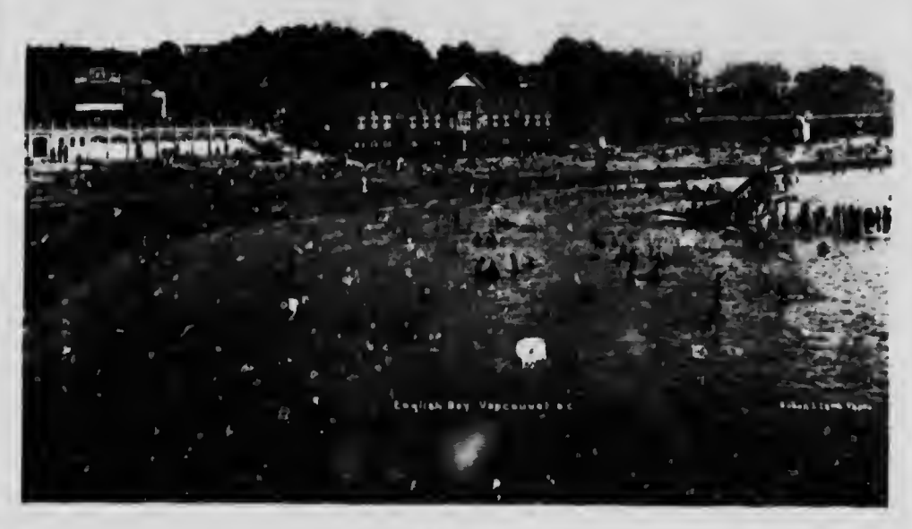
English Bay, Vancouver