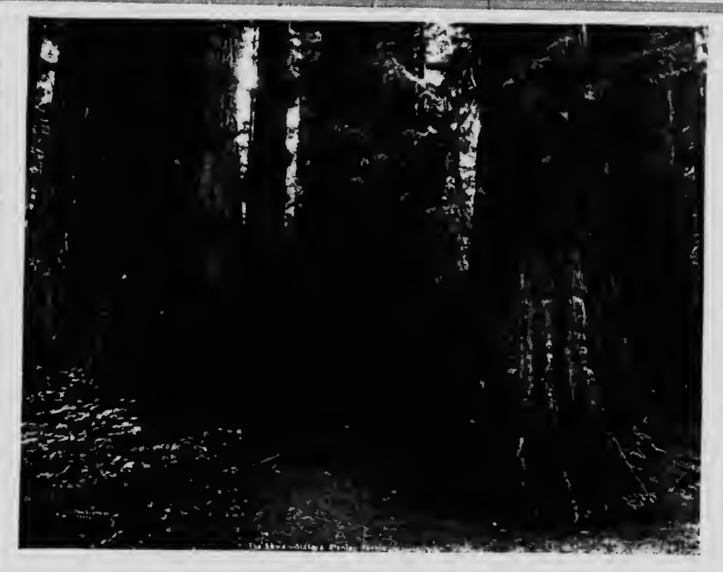
Big Trees, Stanley Park