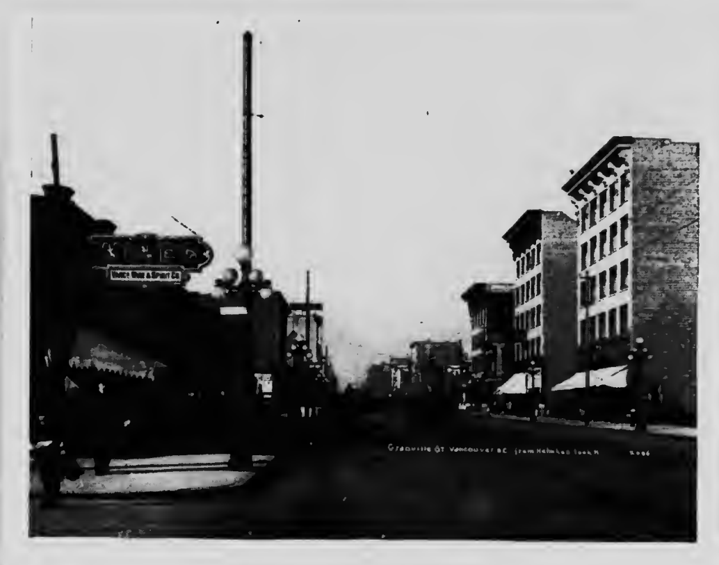
Granville St., Looking from Helmcken