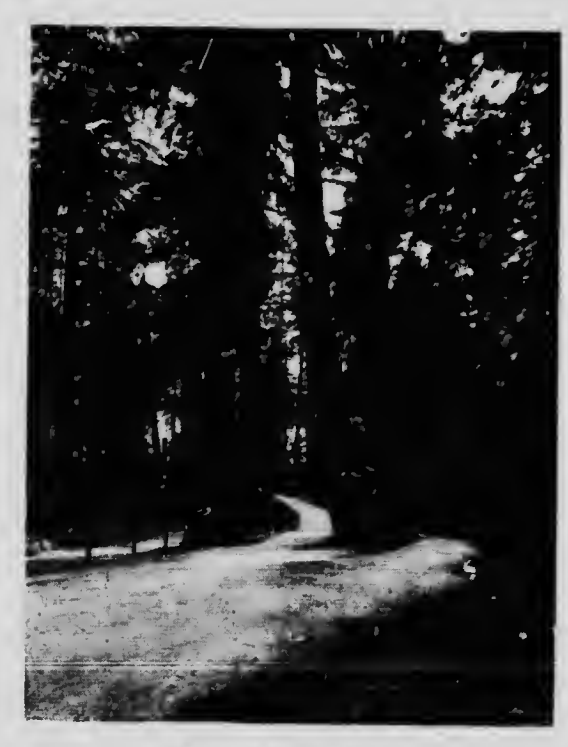
Stanley Park, Vancouver