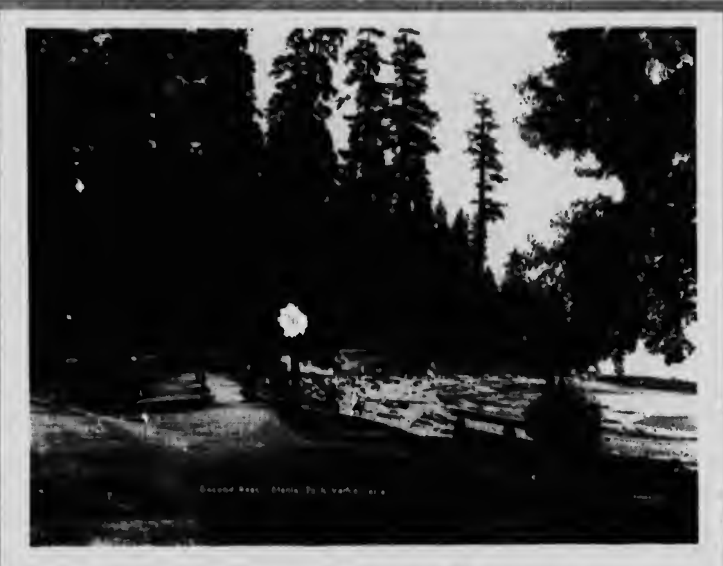
Second Ecach, Stanley Park