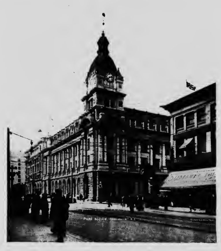
Post Office, Vancouver, B. C.