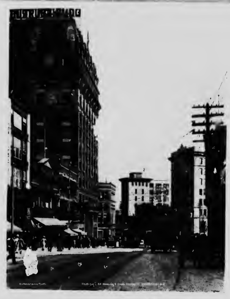
Hastings St., Looking East