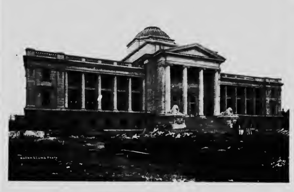
The New Court House, Vancouver