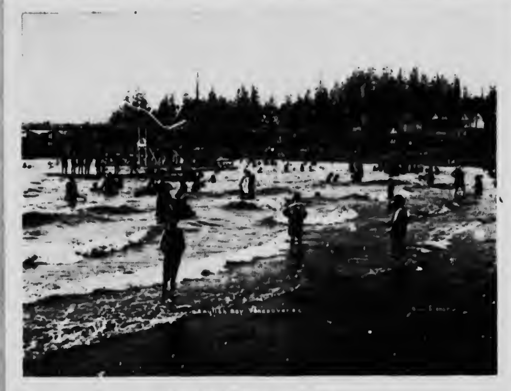
Bathing Beach and Pier, English Bay