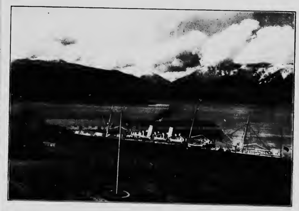
The Harbour, Vancouver.