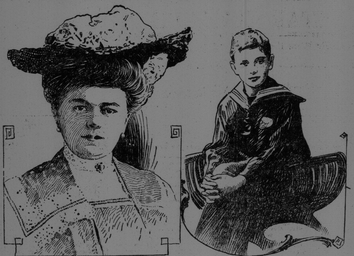
FIGHTING FOR HER CHILD AND A THRONE. Archduchess Marie Sophie, wife of the late Emperor Franz Joseph, and Franz Ferdinand, who was her son, although morganatic, must succeed his father.