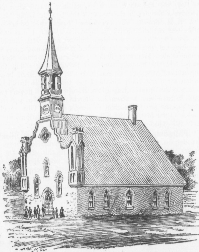
FRENCH BAPTIST CHURCH. SOREL, P.Q.