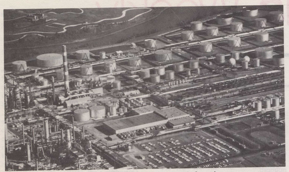
Oil and gas prices will rise steadily under a made-in-Canada formula.

the oil sands and on the Canada Lands — the agreement provides for higher prices on future oil discoveries, recognizing that they will be relatively high-cost, high-risk ventures. This "new oil" price will be closer to world prices and, with certain exceptions, will rise on a regular, fixed, made-in-Canada schedule.