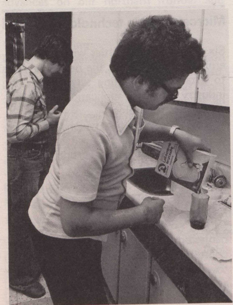
Two young men prepare dinner at their apartment located in the west central part of Toronto. It is just a couple of blocks away from Ashby House where they went through a rehabilitative program for young adults with brain damage.

"The program we offer these young people, in a family environment, helps