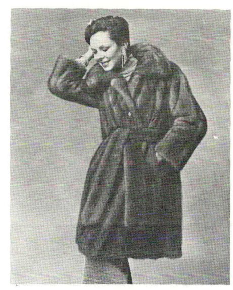
Natural Royal Samink coat designed by I. Wasserman Incorporated for Furmillion Corporation of Manitoba.

Samink garments retail in a range comparable to sable. A full length coat