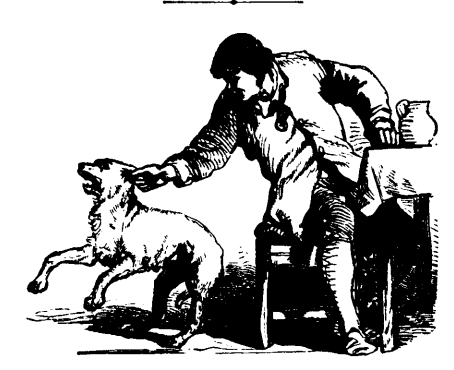
From the "Sunday School Almanac."

"Hearken unto thy father that begat thee, and despise not thy mother when she is old. The father of the righteous shall greatly rejoice: and he that begetteth a wise child shall have joy of him. Thy father and thy mother shall be glad, and she that bare thee shall rejoice."