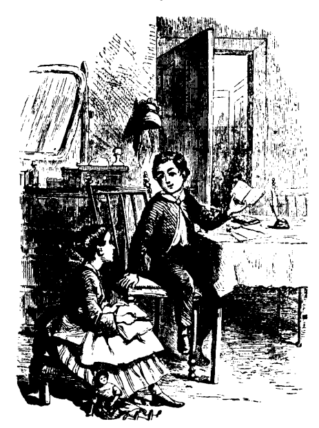
For the Sunday-School Advocate.