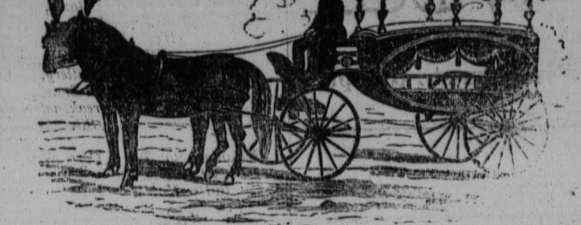
(Cut of our new Hearse.)