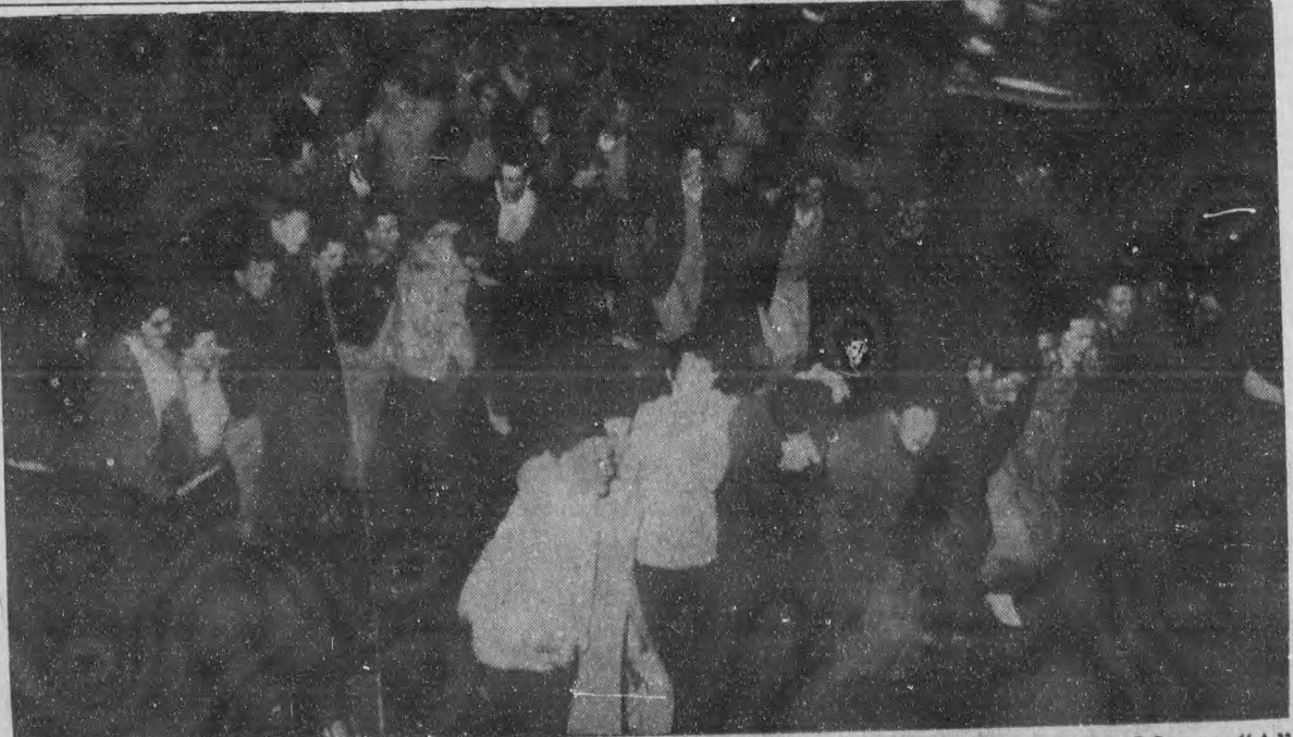
Friday night's Pep Rally, in preparation for last Saturday's game against Mount "A" was followed by the usual downtown parade. Here is a section of the large crowd, swaying precariously down Queen Street.