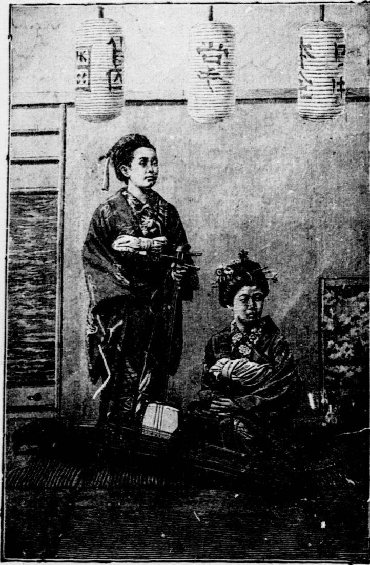
JAPANESE LADY MUSICIANS.