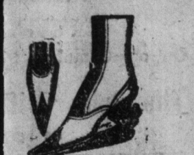
Shoes like this 55c.

this great sale lasts the face of the earth, ter, and we've some d them—but all are