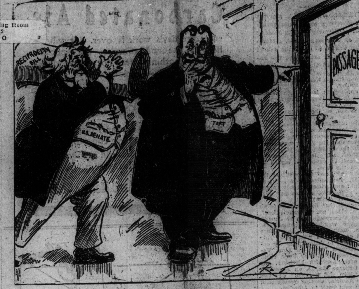
"Every little movement has a meaning all its own."—From The Montreal Star.