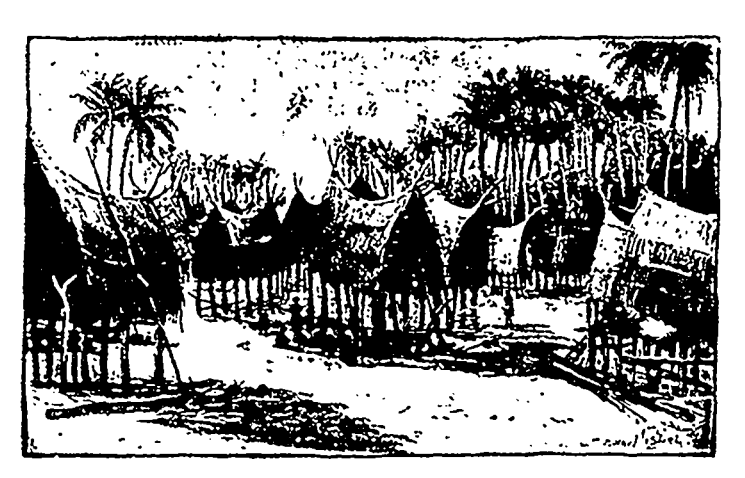
A NEW GUINEA VILLAGE.