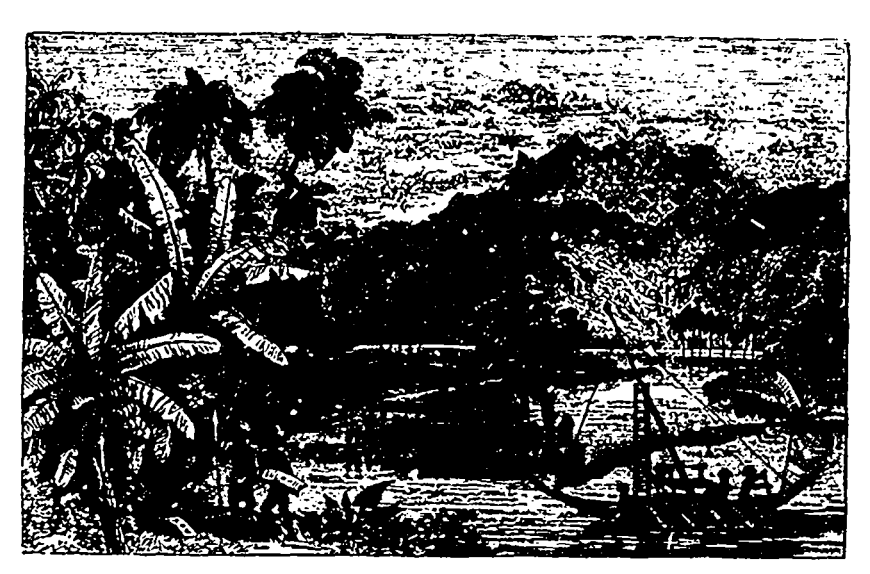
DOREY HARBOUR, NEW GUINEA.

New Guinea lies to the North of Australia,