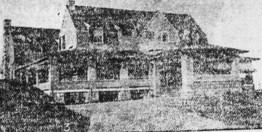
(1) On the Golf Links at St. Andrew's, New Brunswick. (2) Picture of a statue of St. Andrew erected on one of the local church walls. On the head is a robin's nest. (3) Residence of Lord Shaughnessy at St. Andrew's.

NEARLY everybody knows that golf was first played by the Scotch. A veteran devotee of the game, once said that Scotland's greatest contribution towards the welfare of mankind was the royal and ancient game.