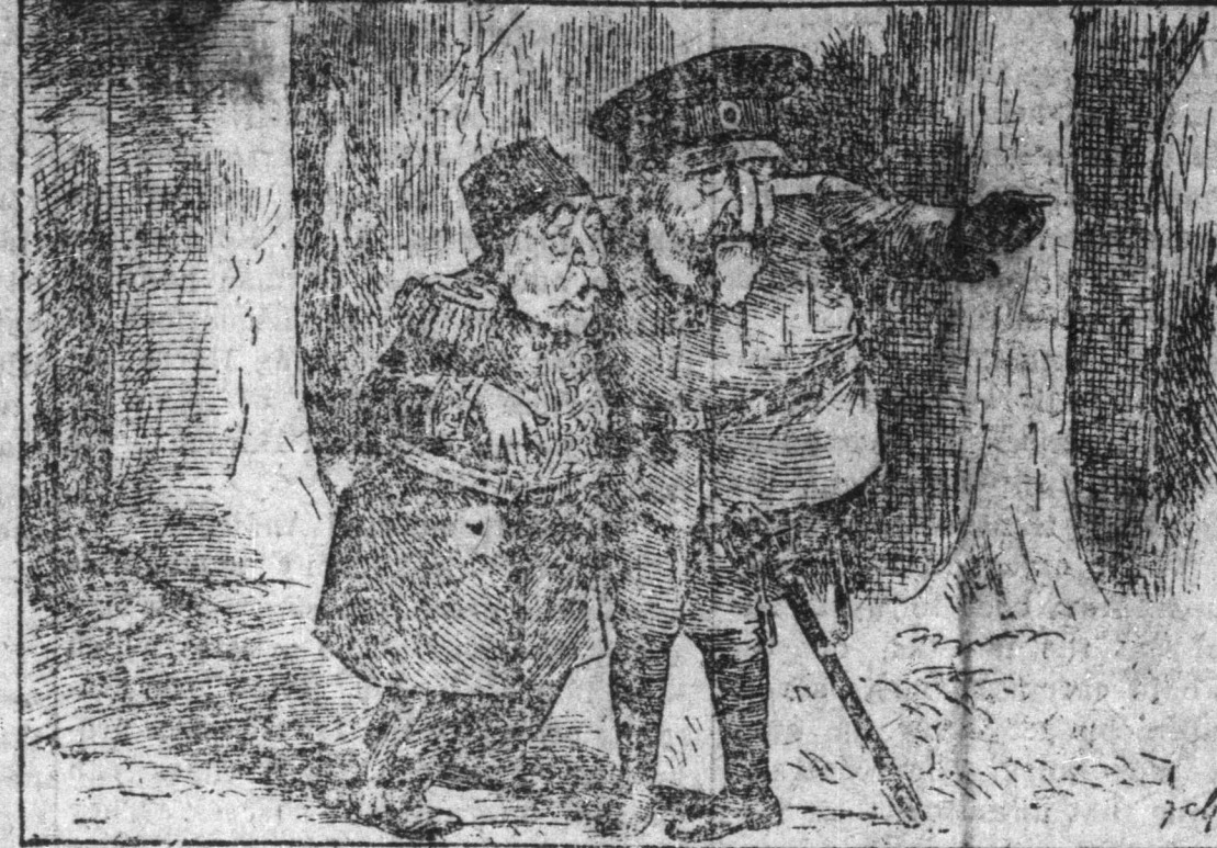
THE BABES NOT OUT OF THE WOOD.

FERDINAND: There's that Russian Bear loose again! THE SULTAN: And he's bigger than ever.