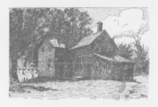
RESIDENCE OF 8. REEVES.

has always held sway in this little village. Quoits (horse shoes) have pased many a summer's evening merily away. The spot for this game is just at the back of the store outside the fence. The big elm tree that stands directly along by the sidewalk forms the vantage ground of one side of the play. Footbali is played in Mr. Sig. Reeves' flat or