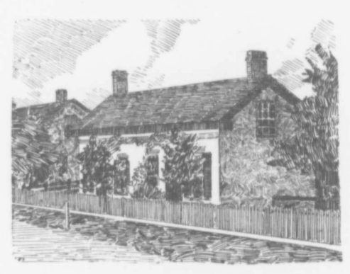
THE SIBBALD RESIDENCE, SHOWING THE CHAMBERLAIN COTTAGE