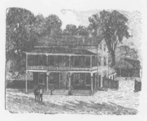
MEADOWVALE HOTEL-J. CALLAGHAN, Proprietor.

Turning now to present day affairs a considerable amount of business is done at the different mills, the chopping mill possibly being the