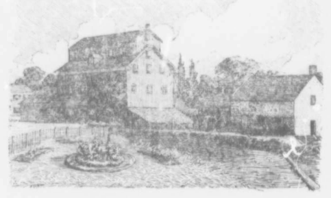
MEADOWVALE MILLS, OWNED AND RUN BY H. A. BROWN,

When one thinks of the mail train morning and night, the Toronto daily papers, with their busy mills running and a host of industrious villagers, it is hard to imagine that the road, which is now the main thoroughfare leading to the station was but a narrow track thru the woods, and the greater part of it built of logs to keep one from sinking in the nitr; even fences were not deemed necessary. The land at this time, on either side of the road between where the Methodist church