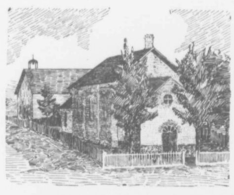
METHODIST CHURCH AND PUBLIC SCHOOL

that there is good skating on the pond at times, especially in the evevenings when the bonfires are lit, and it's worthy of notice that this winter, which has been the severest on record for 60 or 70 years, altho plenty of ice, there was less skating than in former years.