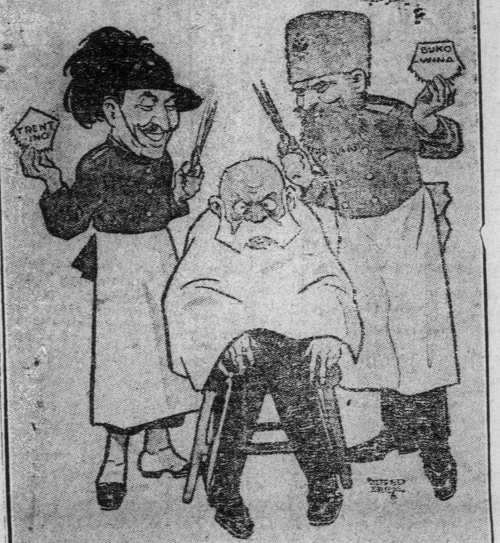
"Would you like a little more off, Sir?"—London Opinion.

LABOR TROUBLES. By Special Wire to the Courier. San Antonio, Tex., Aug. 1.—A general strike of all affiliated labor unions in Mexico City occurred Sunday morning according to messages received to-day by Mexican Consul General. The men are demanding pay on a gold basis inasmuch as all business houses are operating on a gold basis. The Tramways, electric light and power and mining district employees are out and operations are suspended. The message said.