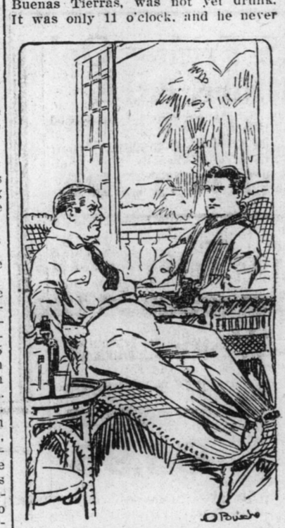
Arrived at his desired state of beatitude - a state wherein he sang ancient mauldin vaudeville songs and pelted his screaming parrot with banana peels - until the middle of the afternoon.

By O. HENRY (Copyright by Doubleday, Page & Co.) (Continued from Tuesday.) "Warmish, buddy," said the captain. "But a regular Paradise Lost for elegance of scenery and beauty of geography. You're wakened every morning by the sweet smirch of red birds with seven purple tails and the slight breeze in the pines and roses. And the inhabitants never work, for they can reach out and pick steamer baskets of the choicest hot-house fruit without getting out of bed."