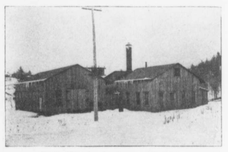
The Muskoka Foundry Company, Bracebridge,

Another important industry that Bracebridge is proud of, is the Hess Furniture Company, a