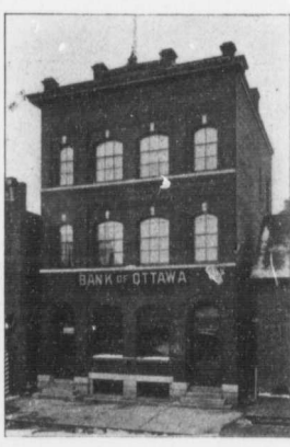
Bank of Ottawa, Bracebridge.

where previously there was nothing but lumber camps and scattered settlers. Bracebridge forged ahead as the business centre of the district not only for the neighboring settlers, but as a semi-whole-sale mart for the smaller places, whose traders find it pays them better to select their goods here than place their orders with city houses; so that many of our stores carry an assortment of goods that in style and quantity surprise the visitor who thought he was coming to the backwoods. And this is particularly the case with the ever-increasing tide of tourists who flock to the cool retreats of our