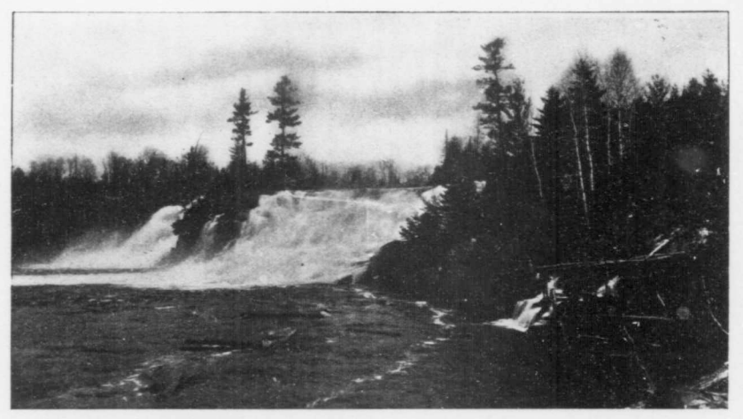
High Falls, near Bracebridge.