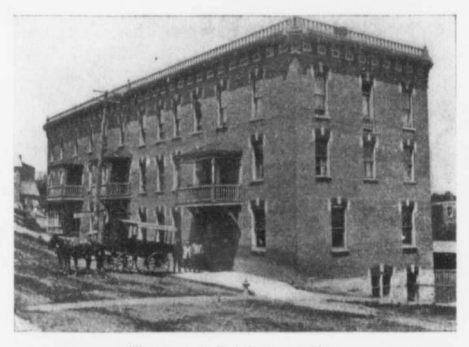
The Queen's Hotel, Bracebridge.

A more majestic scene however, is the Great South Falls which are located on the north branch of the river, about three miles above Bracebridge. In the level country when nearing the river, there is nothing to give evidence of the approaching gorge; and from the bridge which spans the river