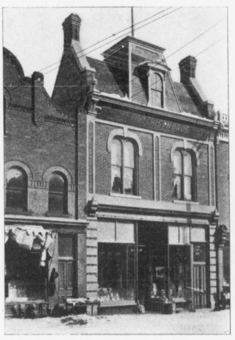
Hutchison Brothers' Store, Bracebridge.

business, the capacity of their plant being in the neighborhood of three million pounds. The company is an up-to-date one, and the management recognizing the methods of modern ways are constantly adding to their plant, machinery that is needed to turn out their output with dispatch, and labor-saying devices that bring the price of their