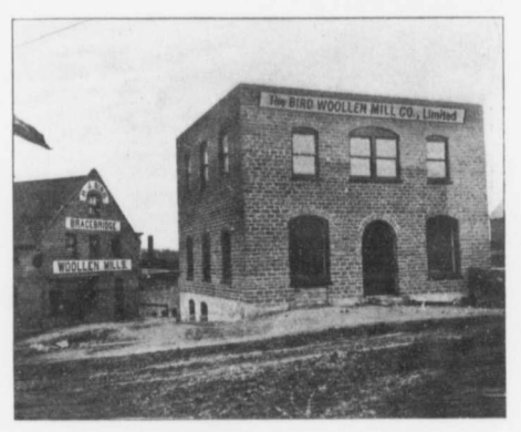
The Bird Woollen Mill, Bracebridge.

Passengers from Eastern points, such as Quebec, Portland, and intermediate stations, proceed via the main line of the Grand Trunk or Canadian Pacific Railways through Montreal to Toronto, and those from Boston and all New England points,