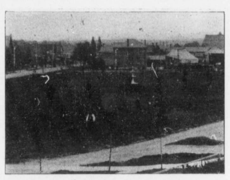
Memorial Park, Bracebridge.

The beautiful and commodious building erected a short time ago by the Bank of Ottawa, and used exclusively by them, speaks volumes for the confidence financial men have in the future of the town.