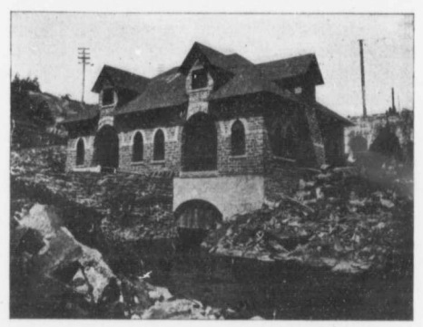
The Power House, Bracebridge.

The town corporation owns a magnificent water power, operating its own water and electric systems,