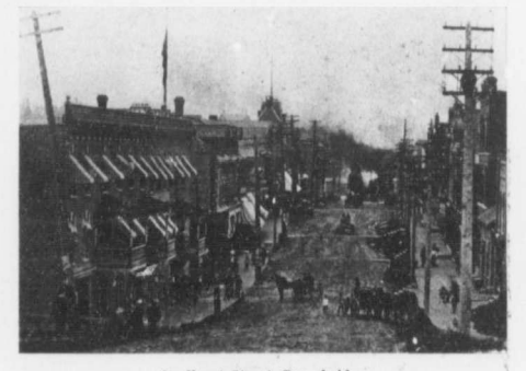
On Front Street, Bracebridge.

RACEBRIDGE holds forth to the manufacturer unlimited attractions, and many are taking advantage of these and are securing desirable sites for the erection of extensive buildings and the installation of mammoth plants. Situated 120 miles north of Toronto, on the northern division of the Grand Trunk Railway System, it is recognized by all classes of com-