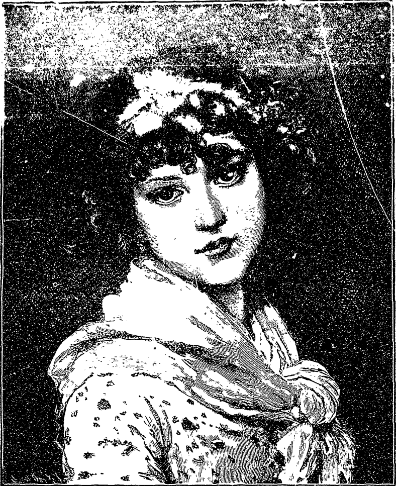
CHERRY RIPE. ( See third page. )