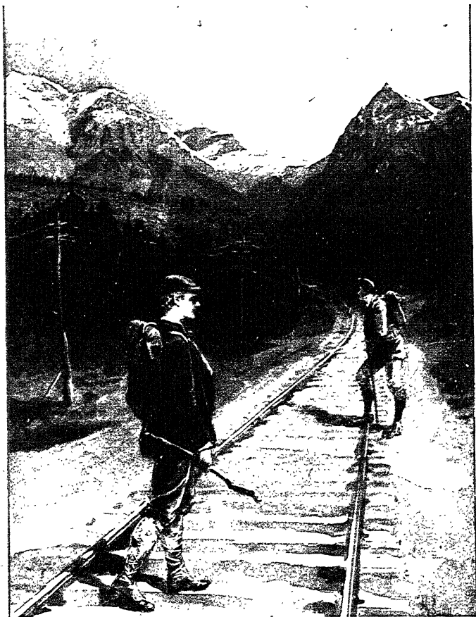
"ALL THAT AFTERNOON THEY WALKED IN THE SHADOW OF MOUNT STEPHEN."—Page 315.