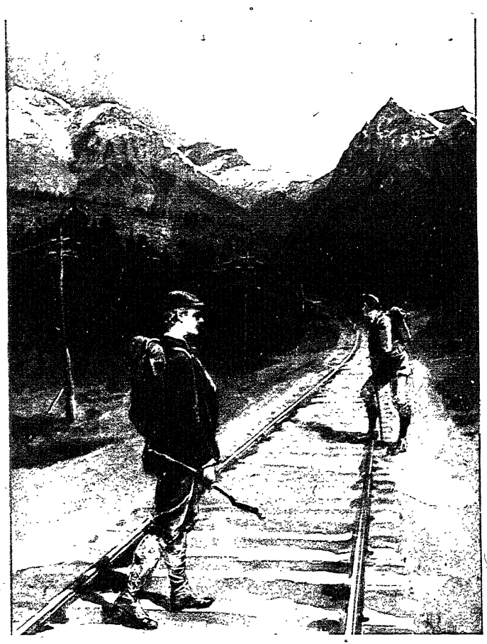
"All that Afternoon they walked in the Shadow of Mount . Stephen:"—Page 315.