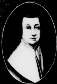
MADAM DE LA PELTRIE