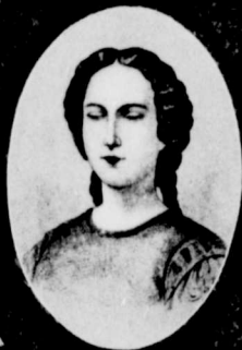
MADELEINE DE VERCHERES