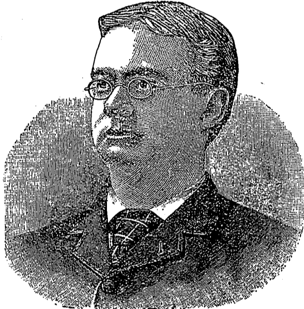
WILLIAM RAINEY HARPER, LL.D.

There is not a drop of Jewish blood in my veins; I am not connected with the Jews by the marriage of any near or distant kinsman; I owe no Jew a dollar and no Jew owes me. I speak from the vantage ground of absolute independence. It is a splendid race, splendid in their patience, in their love for one another, in their endurance, in their sagacity and temperate habits, and splendid in their inflexible adherence to their Mosaic ideals. Do you want an aristocracy of blood and birth? The Jews are the purest blooded people and have the best established descent in the world. Not Mirabeau in the French Convention, nor Patrick Henry in the House of Burgesses, nor "Sam" Adams in old Colonial days ever said a more thrilling thing than Disraeli said in the English Commons in reply to the charge that he was a Jew: "Yes, I am a Jew! When the ancestors of the honorable gentleman