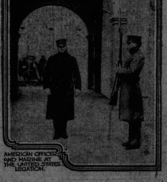
AMERICAN OFFICE AND MACHINE AT THE LEGATION QUARTER.