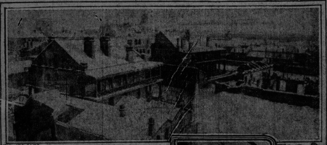
VIEW OF THE FOREIGN LEGATIONS IN PEKIN, WHERE FOREIGN RESIDENTS HAVE CONCENTRATED.

Americans and Europeans in Peking, Hearing of Republican Commander's Plan to Move on Capital, Congregate at Foreign Legations.