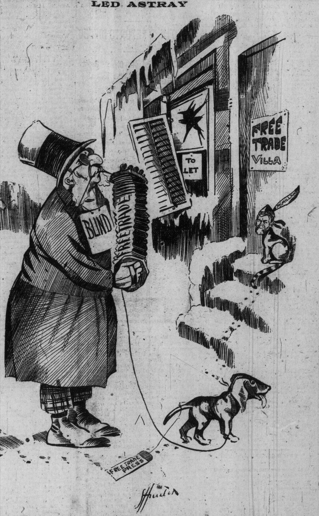
OR—THE BLIND MINSTREL AND THE DESERTED HOUSE.