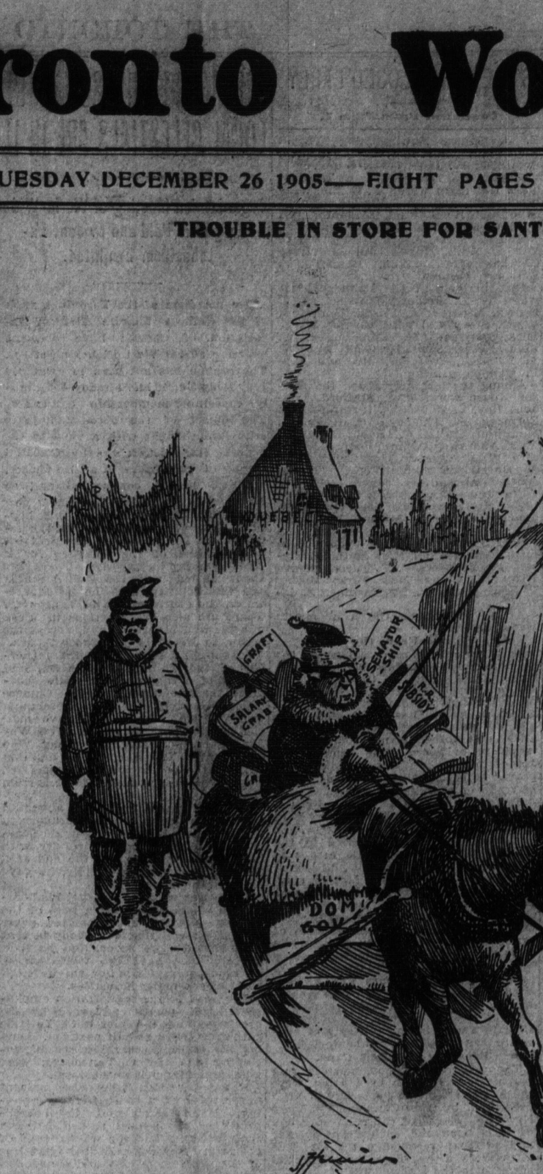
M'sieur Gouin, as 'Santy' passes: 'Oh! So! I look lak we git no'ting at our house dis Christmas, eh?'

CHINA TO MAKE DEMANDS.—Carrying Shanghai Disturbances Before British Government.