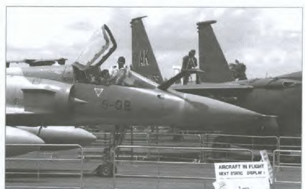
An aircraft viewing area at Asian Aerospace 2004

On the margins of Asian Aerospace 2004, trade commissioners from six Southeast Asian countries met to form a regional aerospace and defence