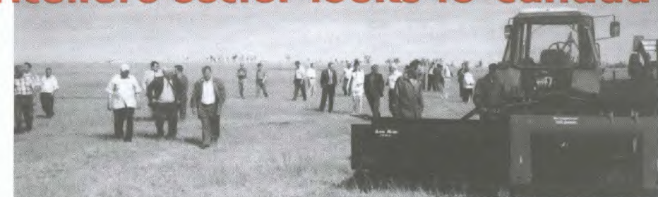
Swather on display: DonMar, a Canadian maker of agricultural machinery, exhibits its products in a steppe near its plant in Lisakovsk in Central Kazakhstan.

Kazakhstan is also the sixth largest wheat producer in the world. Since