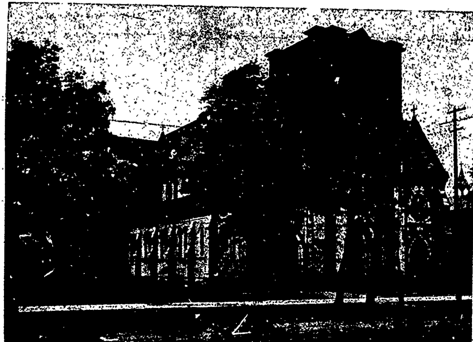
EXTERIOR ST. MARY'S CHURCH TORONTO

the old question, which now threatens to disturb the peace of the Galician settlers in the west.