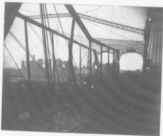
THE HULL-OTTAWA FIRE. Ruins of Main Bridge at Chaudière.

$220,696, and that this result was accomplished with an actual decrease of over $10,000 in the expense account. The latter large increase places the Sun Life of Canada ahead of all the other Canadian companies in the matter of net premium income. A large gain was likewise shown in the assurance in force, 13,101