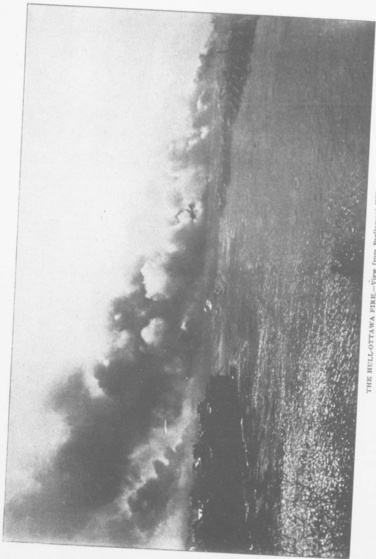
THE HULL-OTTAWA FIRE.—View from Parliament Hill.