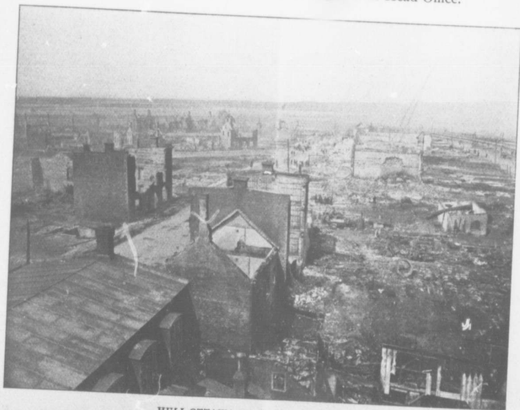
HULL-OTTAWA FIRE.—LeBreton Flats.