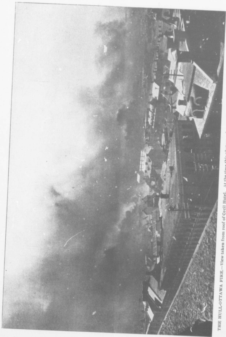
THE HULL-OTTAWA FIRE.—View taken from roof of Cecil Hotel. At the time this photograph was taken the fire covered an area of nearly five miles.