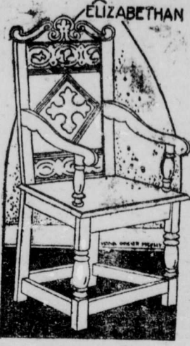
In making a study of period fur-nishings one is impressed by the in-diuence the life and customs of ar-era had upon the designs executed at the figs. Necessity was ever a guiding hard

and comfort the aim. Therefore, when necessity demanded sturdy, massive articles and heavy tapestries to keep warm the cold interfors they were produced. Chair backs were made high to keep the drafts from their occupants. The wing chair had its origin in such a service.